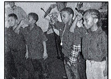
Ivanhoe Cub Scout Pack 4014 stand and salute the flag at the Blue & Gold Banquet